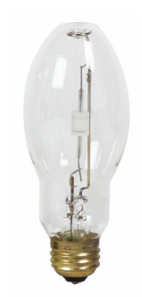
E26, ED-17P, CL, Elite, 50W-100W /930