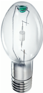
LPPR D-CDM-PS 0002