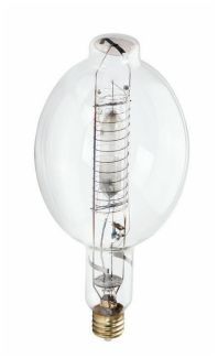
LPPR D-MP BT56 CL