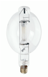
LPPR D-MH-R BT56 CL