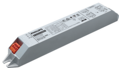
EB-Ci 1-2 Lamp 14-28W TL5 220-240V