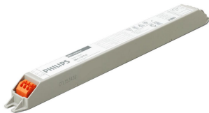
Fluorescent Fixed Output Gear, EB-C, 128, TL5