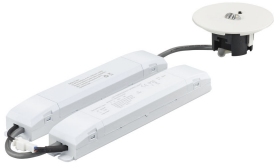
Emergency downlight EM120B