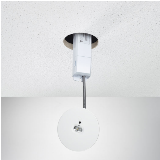
Installation of EM120B in 68 mm hole