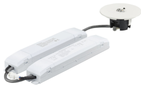
Emergency downlight EM120B