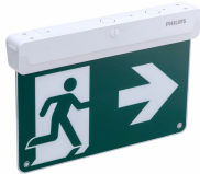
Emergency light LED exit sign