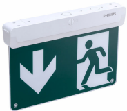
Emergency light LED exit sign