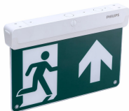
Emergency light LED exit sign