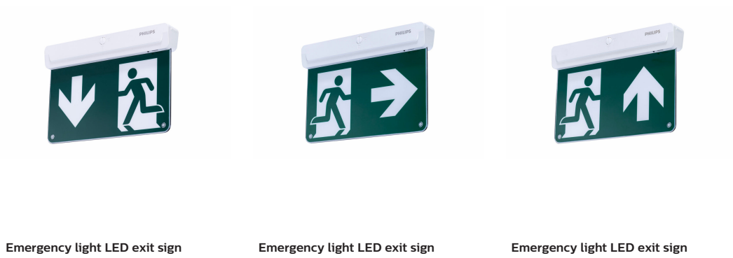
Emergency light LED exit sign