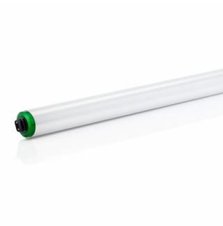
110W T12 Cool White Tubular Fluorescent - RFT