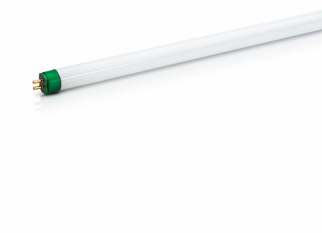
28W T5 Neutral Tubular Fluorescent - RFT