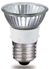
50 W E27 cap Halogen reflector bulb - RFT