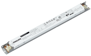
Lamp Driver, eFluo, HF-P 154/155 TL5 HO/PL-L III IDC