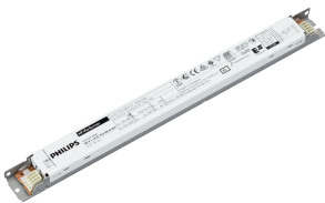
Lamp Driver, eFluo, HF-P 114-35 TL5 HE III 220-240V