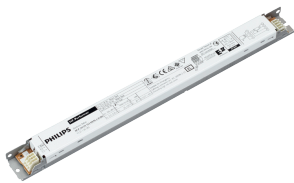
Lamp Driver, eFluo, HF-P 154/155 TL5 HO/PL-L III IDC