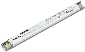
Lamp Driver, eFluo, HF-P 114-35 TL5 HE III 220-240V