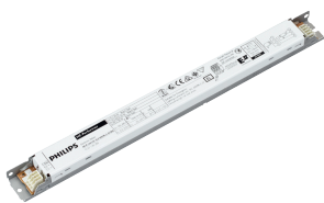
Lamp Driver, eFluo, HF-P 154/155 TL5 HO/PL-L III IDC