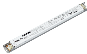
Lamp Driver, eFluo, HF-P 2 14-35 TL5 HE III 220-240V