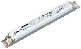
Lamp Driver, eFluo, HF-P 258 TL-D III 220-240V 50/60Hz IDC