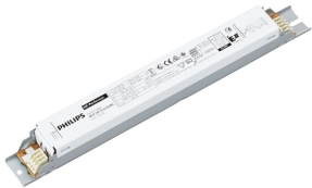
Lamp Driver, eFluo, HF-P 158 TL-D III 220-240V 50/60Hz IDC