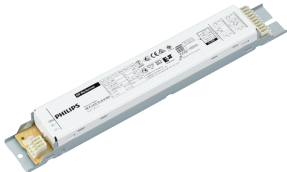
Lamp Driver, eFluo, HF-P 3/418 TL-D III 220-240V 50/60Hz IDC