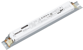
Lamp Driver, eFluo, HF-P 136 TL-D III 220-240V 50/60Hz IDC