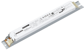
Lamp Driver, eFluo, HF-P 236 TL-D III 220-240V 50/60Hz IDC