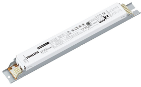
Lamp Driver, eFluo, HF-P 236 TL-D III 220-240V 50/60Hz IDC