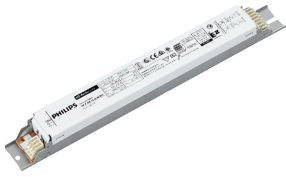
Lamp Driver, eFluo, HF-P 258 TL-D III 220-240V 50/60Hz IDC