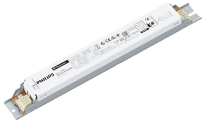
Lamp Driver, eFluo, HF-P 136 TL-D III 220-240V 50/60Hz IDC