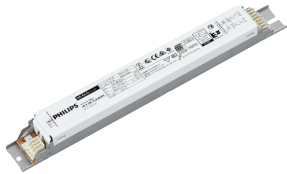
Lamp Driver, eFluo, HF-P 258 TL-D III 220-240V 50/60Hz IDC