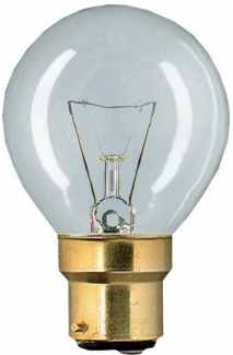
LPPR ILUSBSTD B22 P45 CL