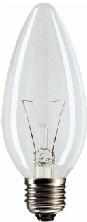
LPPR_ICANESTD_E27_B35_CL- Product photo