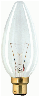
LPPR ICANBSTD B22 B35 CL