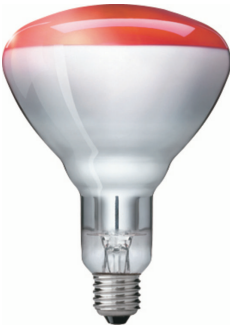
BR125 IR 250W E27 230-250V Red