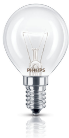
40 W E14 cap Oven Incandescent appliance bulb - RFT