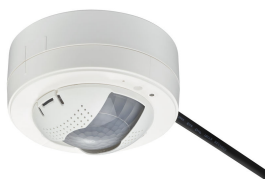
MPS3100 Sensor Product Detail Image