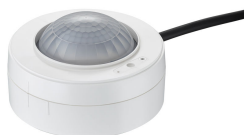
MPS3100 Sensor Product Standard Image