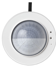
MPS3100 Sensor Product Detail Image