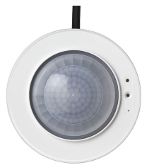
MPS3100 Sensor Product Detail Image