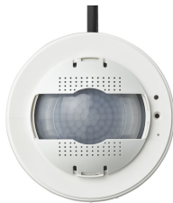
MPS3100 Sensor Product Detail Image