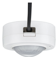
MPS3100 Sensor Product Detail Image