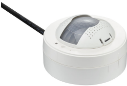
MPS3100 Sensor Product Detail Image