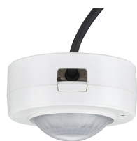
MPS3100 Sensor Product Detail Image