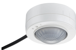
MPS3100 Sensor Product Detail Image