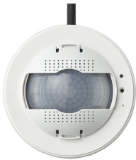
MPS3100 Sensor Product Detail Image