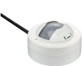
MPS3100 Sensor Product Detail Image