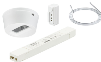
Interact Ready RF-DALI Connector Kit