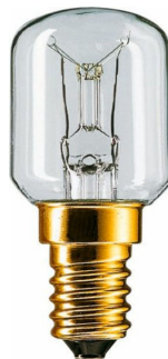
LPPR_ITUBE_E14_T25_CL- Product photo