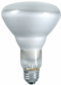
LED lamp - RFT