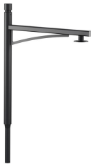
ClassicStreet brackets-JGB794 MBP-S 60P