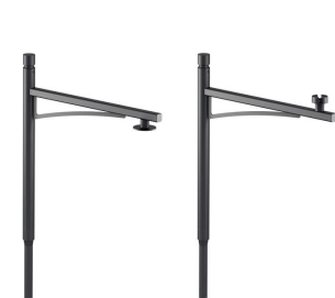
Suspended and post top versions