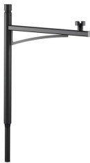
ClassicStreet brackets-JGB795 MBP-S 60P