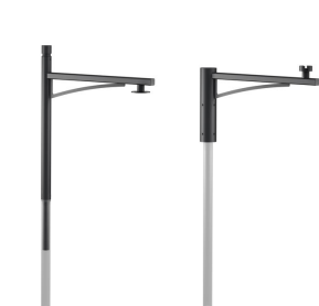
Tenon and cap versions