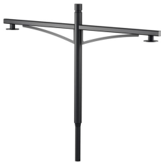
ClassicStreet brackets-JGB794 MBP-T 60P