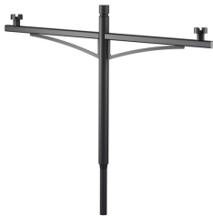
ClassicStreet brackets-JGB795 MBP-T 60P