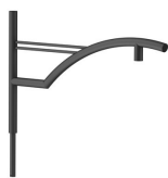
Reverbere SA bracket-JSP105 S1150