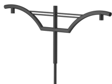
Reverbere DA bracket-JSP105 S900