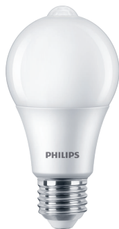
LED Sensor A60 E27 WW POS1