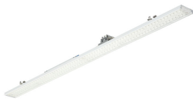
Maxos Fusion Panel-LL512X WB WH