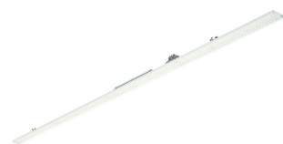
Maxos Fusion Panel-LL523X WB WH