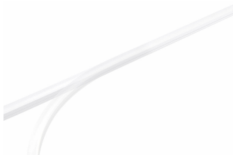
Flex Cove - Neon Indoor