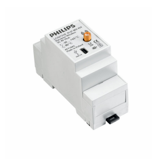
RF Segment controller Module