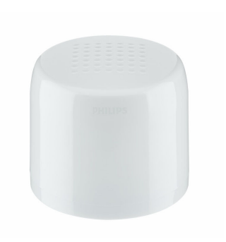
NEMA 5PIN AC LV; IEC only Light Grey, light sensor, GPS