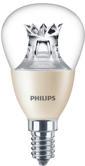
LEDluster MAS SLR1 P48 E14 CL