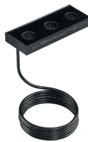
LCU7590 3 Phase Coil