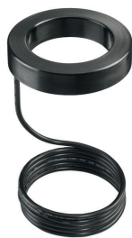
LCU7591 Leak Coil