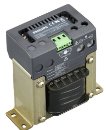
Coded Mains Transformer LN