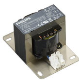
Coded Mains Receiver Adaptor