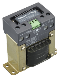
Coded Mains Transformer LL