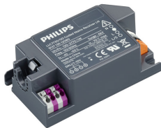
Coded Mains Receiver LN