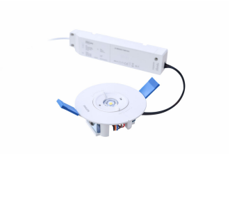
Emergency light LED pathfinder