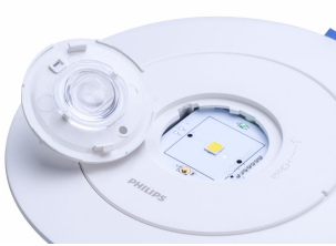
Emergency light LED pathfinder