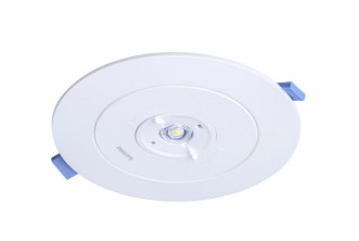
Emergency light LED pathfinder