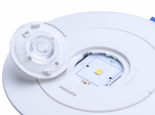
Emergency light LED pathfinder