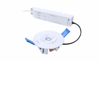
Emergency light LED pathfinder