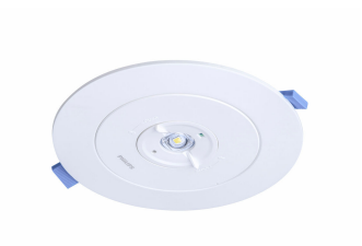
Emergency light LED pathfinder