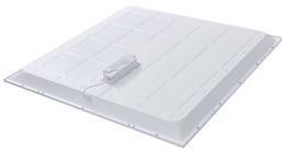
SmartBright Plus Panel