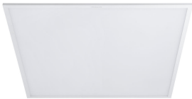
SmartBright Plus Panel