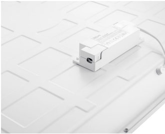
SmartBright Plus Panel