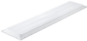
SmartBright Plus Panel