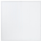
SmartBright Plus Panel