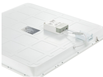
Ledinaire panel Ecoset-backplate_1