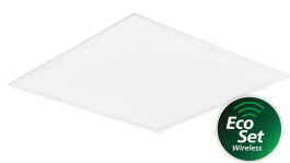
Philips Ledinaire panel EcoSet panel