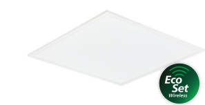
Philips Ledinaire panel EcoSet panel