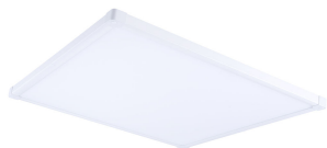
SmartBright Slim Panel KR