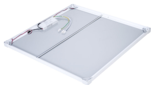
SmartBright Slim Panel KR