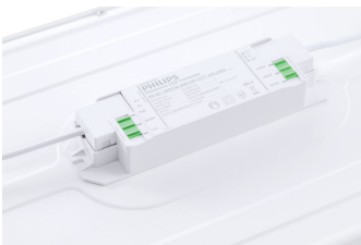
SmartBright Dual Select Direct-lit panel