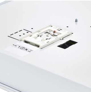
FlexBlend Recessed RC340B PIP Open