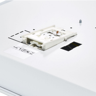
FlexBlend Recessed-RC340B PIP Closed