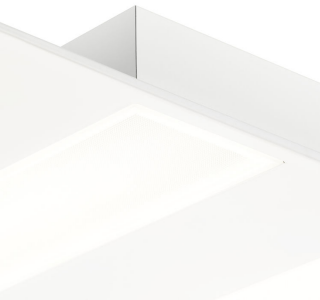
FlexBlend Recessed- RC340B_MLO_DPP