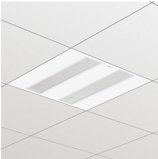
FlexBlend Recessed RC340B W60L60 MLO CPC